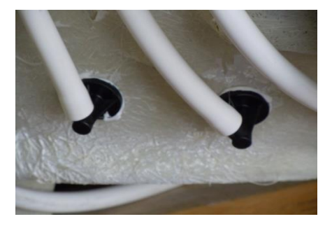
Equipment Inside Tubs